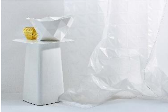
Eprisma white close-up

“Eprisma”, the luxurious and extravagant fabric from the Spring Collection 2015 by Création Baumann is available from specialist outlets from January 2015.