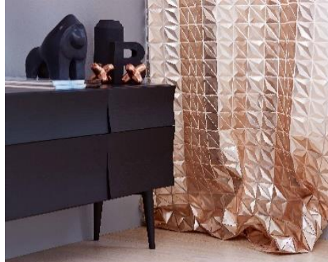
Eprisma bronze close-up