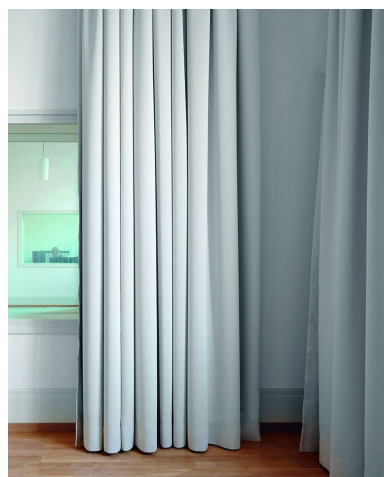
PHANTOM PLUS II ART.-NO. 0100795

Use: Dim-out fabric Number of colorits: 43 Material: 100% Flameretardant polyester Fabric width: 310 cm Weight: 202 g/m 2 Sound absorption: Alpha value 0.60